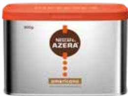
NESCAFÉ AZERA AMERICANO 500g