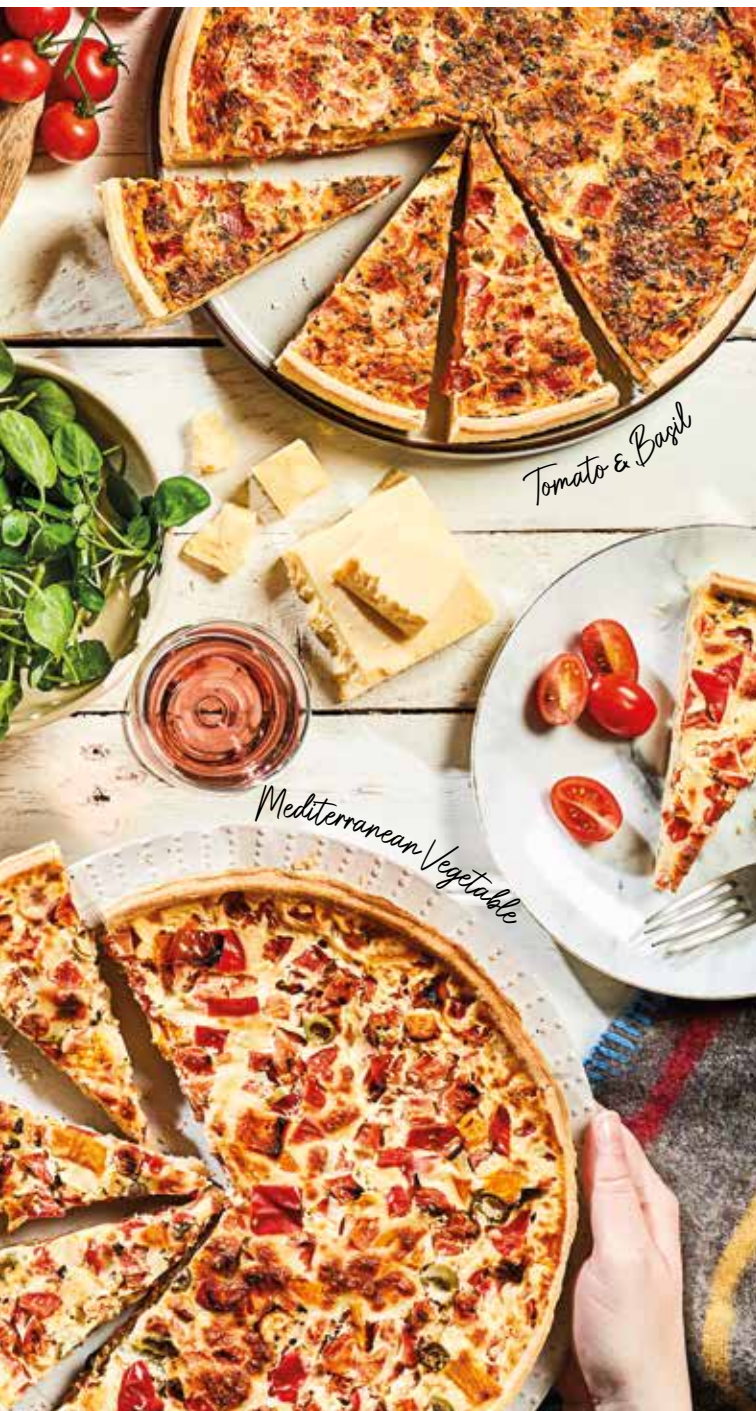
Tomato & Basil