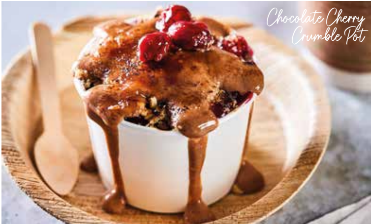
Chocolate Cherry Crumble Pot