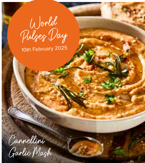
Cannellini Garlic Mash