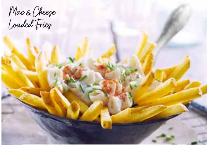
Mac & Cheese Loaded Fries