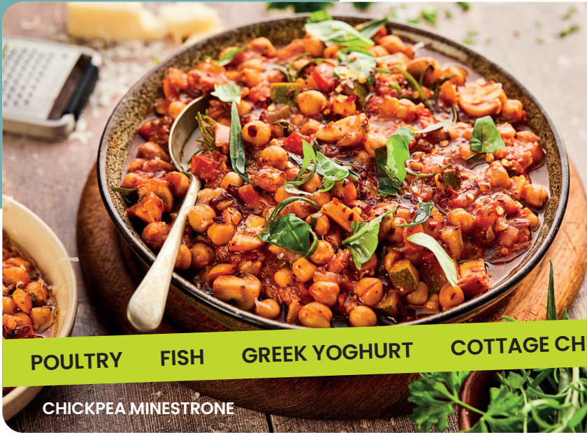
Country Range Chick Peas