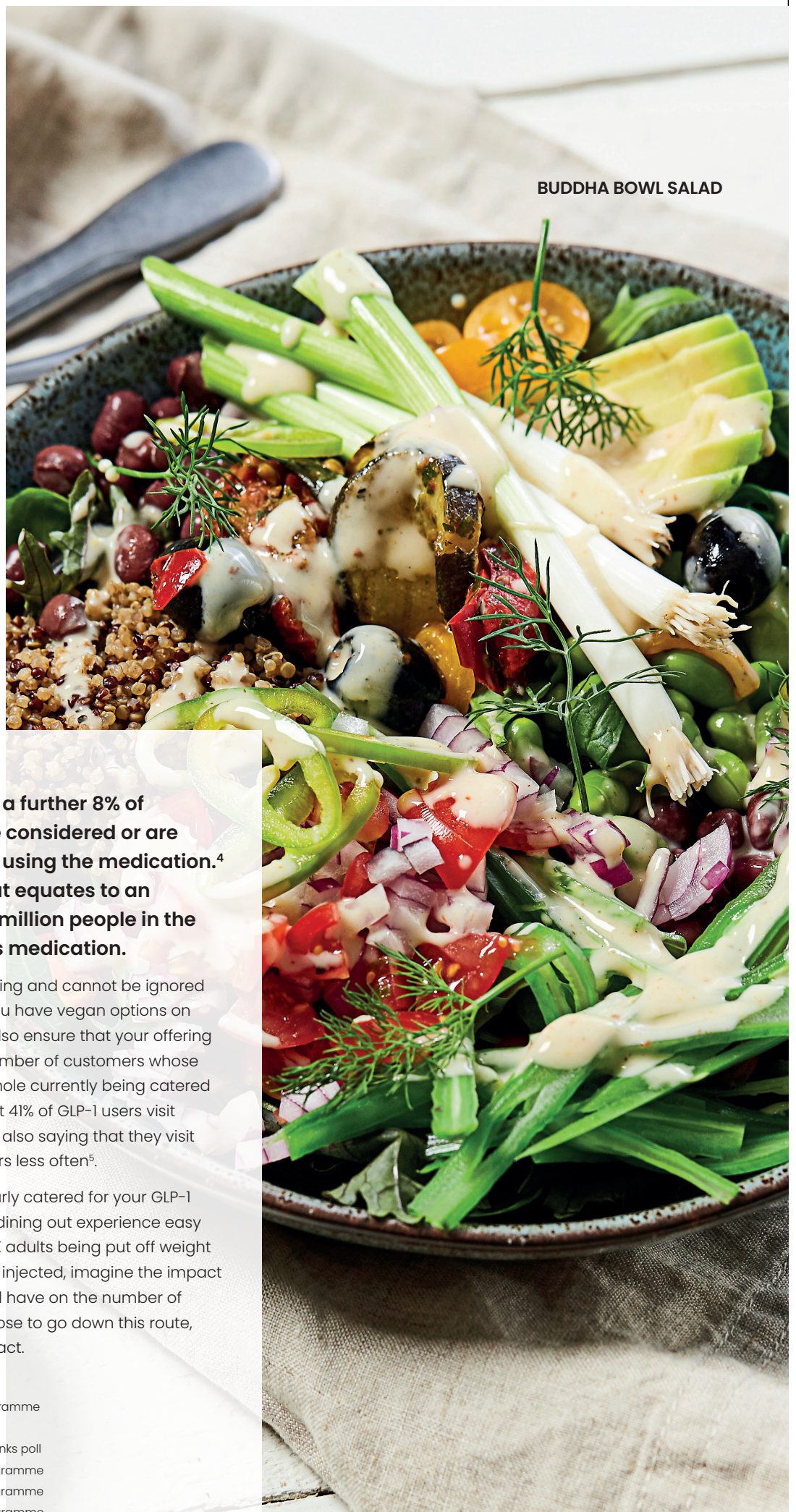
BUDDHA BOWL SALAD

W hat’s more, a further 8% of adults have considered or are considering using the medication. 4 Together, that equates to an estimated 8.25 million people in the UK turning to weight loss medication.